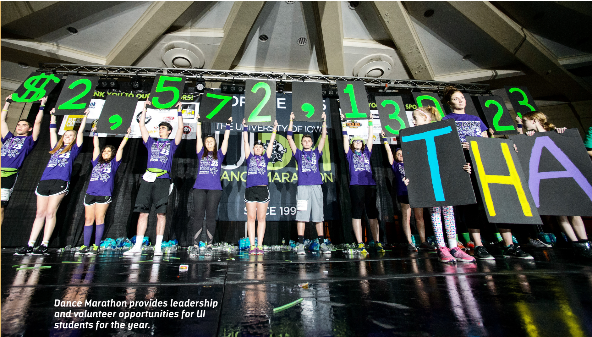
Dance Marathon provides leadership and volunteer opportunities for UI students for the year.